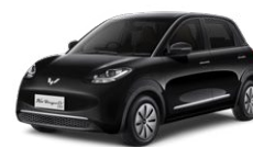
STARRY BLACK LITE ONLY

Setiap gambar, ilustrasi, dan warna mobil mungkin sedikit berbeda dari sesungguhnya. Materi promosi ini tidak menampilkan detail setiap model secara lengkap.