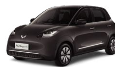
TUNGSTEN STEEL GREY PRO ONLY