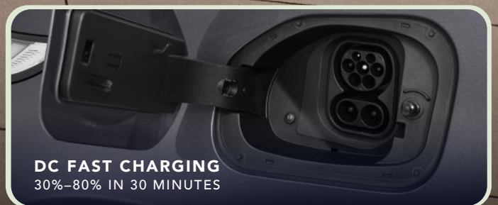
DC FAST CHARGING 30%-80% IN 30 MINUTES