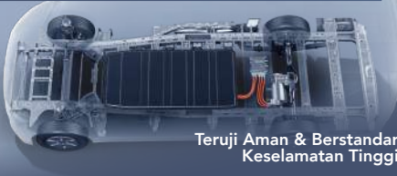
Teruji Aman & Berstandar Keselamatan Tinggi

Pilihan warna mobil dalam materi promosi ini mungkin sedikit berbeda dari warna sesungguhnya. Color options within this promotion material might be slightly different from the actual colors.