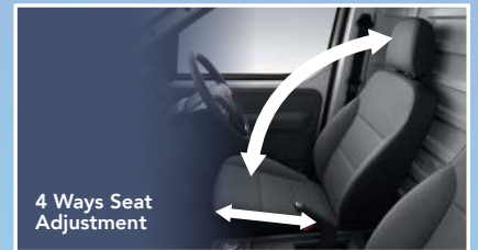
4 Ways Seat Adjustment