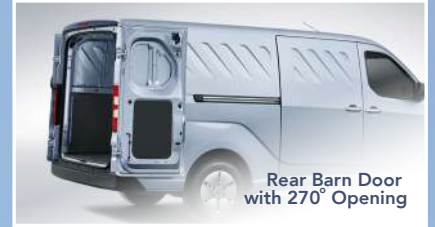
Rear Barn Door with 270° Opening