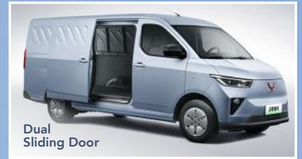
Dual Sliding Door